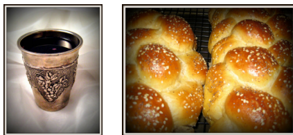
Kiddush Cup (Cup of Sanctification) and Challah (loaves).

This is not the cup or the bread of Passover , which we partake of only once a year, at Passover, according to scripture: 1 Corinthians 11:26 For as-often-as YOU-might-be-eating this bread and YOU-might-be-drinking this cup , YOU-are-proclaiming the death of-the Lord, until of-which he-might-come.