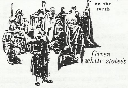
Given white stolees

These Jews are asking for vengeance. They are given white stolees - but not washed in blood. They will be raised from the dead and be "saved." In Revelation there is another