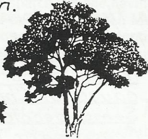
Tree of the Knowledge of good and evil.

In Titus 3:3 and Titus 1:16 "disobedient" to their inherent knowledge of what God calls good. Adam and Eve got this knowledge by eating of the fruit and so passed it on to the entire race. Thus man is responsible.